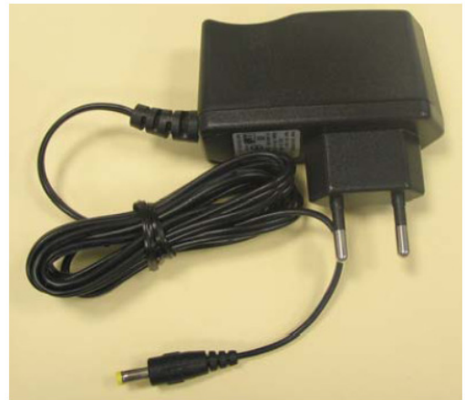
AC Charger (Optional)